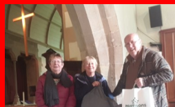
Holiday activities & Food Home Cookery Kits

St. James & Saint Mary Magdalene Quedgeley & Kingsway